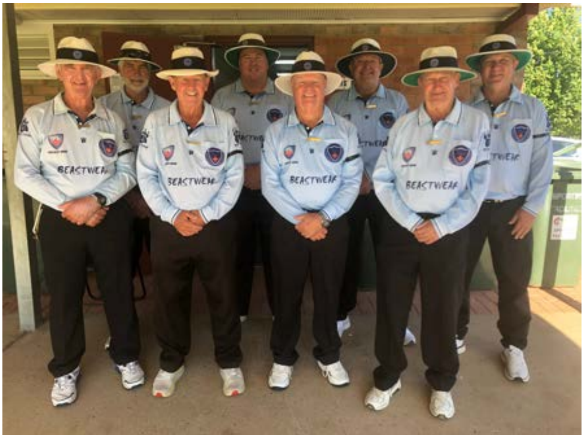
Umpires for the U14 State Challenge at Lady Cutler Sports Complex, Dubbo